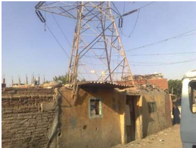
Figure (2) High Voltage Powerlines Passing through Ezbet El Hagana Area, Nasr City, Cairo

the ROW of the medium and high voltage power transmission lines that spans all through different urban areas in cities. A view at the right-of-way (ROW) corridors of the power transmission lines that pass all along different cities in Egypt indicates illegal structures and buildings that have come up. Residential houses, commercial buildings and even workshops with sometime high rise buildings which can be seen right near or under the power lines and towers, this situation is putting the people live or work in these areas under high risk. According to Informal Settlements Development Facility (ISDF) in 2016, there are 50 areas distributed in 15 governorates classified as slums under health hazardous because they are located under high voltage powerlines. Figures (2) and (3) show high voltage powerlines passing through Ezbet El Hagana Area, Nasr City, Cairo.