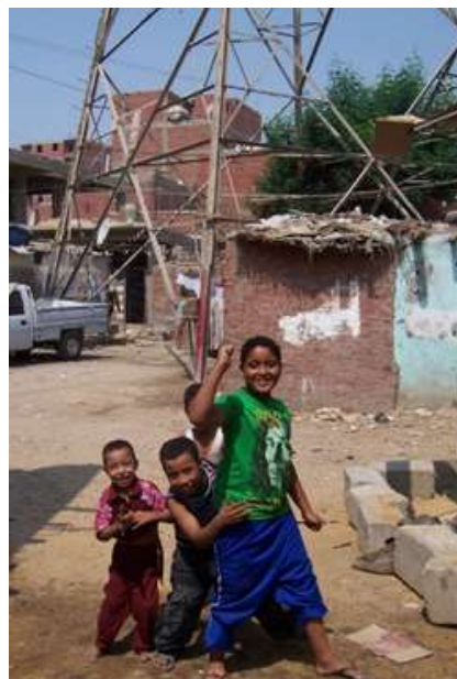
Figure (3) High Voltage Powerlines passing through houses, Ezbet El Hagana Area, Nasr City, Cairo.