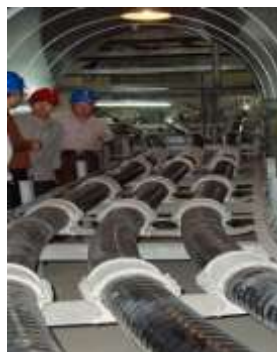
Figure (7): Cross Section of High Voltage Underground Tunnel, China [18].

In recent years technology has allowed for the development of high voltage electricity cables to be placed in dedicated deep-bore tunnels. Though the installation of a deep-bore tunnel is extremely costly but it is an alternative to direct-burial undergrounding in high density urban areas, or in circumstances where the restrictions resulting from a direct-burial cable are not acceptable. Also, the tunnels can be used for other infrastructures routes [18]. Figure (7) shows the cross section of high voltage underground tunnel in China.