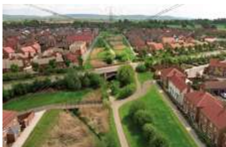
Figure (5): Fairford Leys., An Example of Successful Integration between Development and Overhead Powerlines [16].