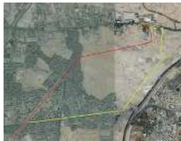
Figure (6): Map Showing the Existing High Voltage Powerlines and the Proposed Route for the Under Ground Cables in Ezbet El Hagana Informal Area, Nasr City, Cairo (By the Author).

In case of Egypt, change the high voltage powerlines to underground cables can be considered as a realistic solution in some high population density informal areas in spite of the higher construction costs involved. Figure (6) shows the proposed route for re-routing of power line in Ezbet El-Hagana, Cairo and it is noticed that the total existing length of the power lines is 7.8 KM and the new proposed route length is 13.3 KM which can cost approximately 350 million LE.